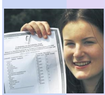
5<sup>th</sup> & 6<sup>th</sup> Year: Follow up courses are available during school year in <u>Dublin</u> on Thursday evenings.

More than learning an essential foreign language, this daunting adventure becomes an enjoyable and maturing experience.